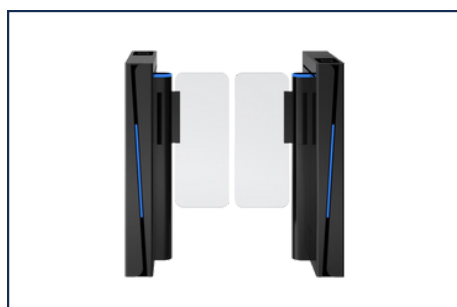
LA3218-1-R/L Single Channel