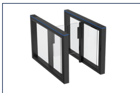
LA3217-1-R/L Single Channel