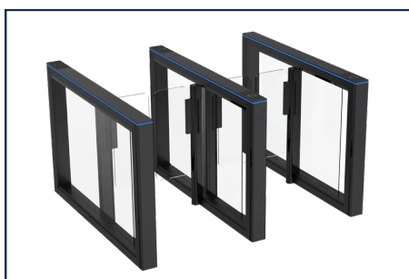
LA3217-2-R/L/M Two Channel