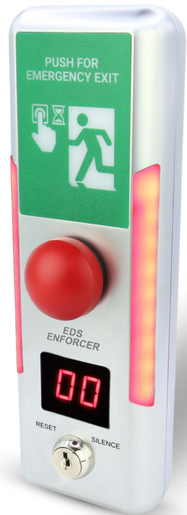
EDS-ENFORCER-ML450 PS5A-12 Power Supply, EDS Controller, ML450 Electric Lock